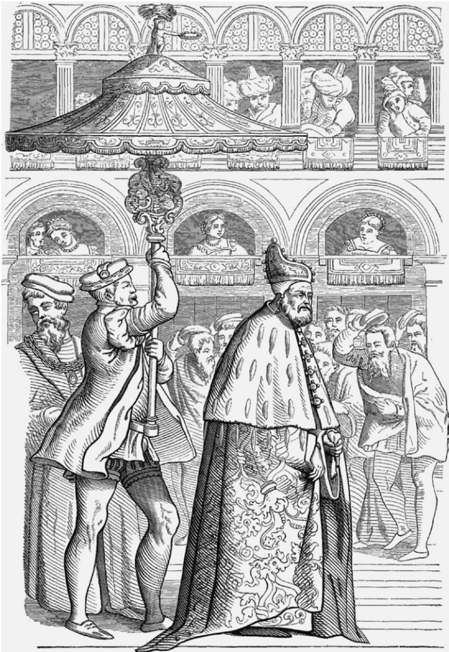
4. The doge leads a procession through the streets of Venice in this sixteenth-century engraving by Jost Amman, an artist commissioned to produce a series of images detailing the ceremony. Processions, the ceremonial heart of the Republic of Venice, were a means of displaying and validating political power and authority.