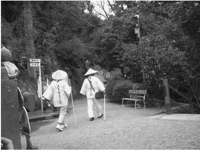
6. Two pilgrims dressed in traditional hakui (white robe) and henro (conical-shaped hat) carry the kongôtsue (walking stick) and enter the precincts of one of eighty-eight temples on the Shikoku pilgrimage trail.

authorities, is a persistent manifestation of all religions throughout history. The classical, prototypical pilgrimage sites include: Jerusalem (Jewish, Christian, and Muslim); Rome (Christian); Mecca (Muslim); Mount Wu-t'ai, China (Buddhist); Benares, India (Hindu); and Mt. Kalish (Tibetan). In addition to these major, global centers, there are thousands of other local and regional pilgrimage sites found all over the world and spread throughout religious traditions. Typologically, pilgrimage is sometimes considered a rite of mobility, along with parades and processions, quests, and the more mundane rites of greeting and exiting.