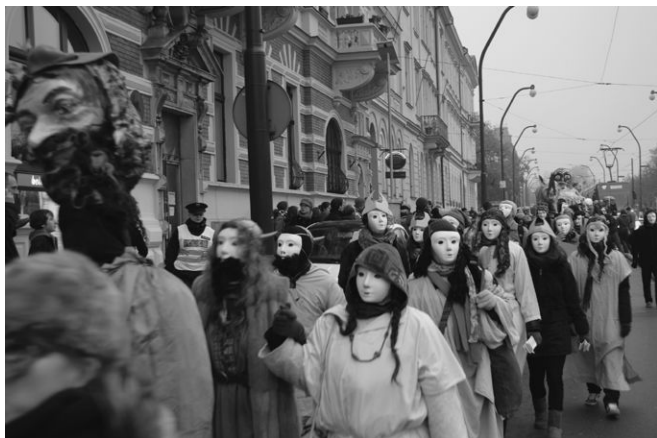
8. Masked figures processing in the Velvet Carnival, Prague. Inaugurated in 2012, this procession aims to keep alive the spirit of progressive social action associated with the peaceful Velvet Revolution, which marked the end of communism in Czechoslovakia.

ones which give each person who uses them the greatest opportunity to enrich the environment with the fruits of his or her vision.”